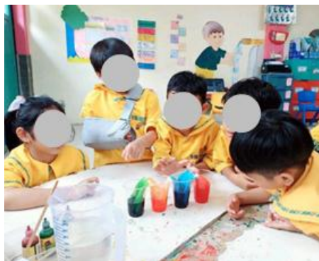
Figure 2. A Child Socializing with His Friend

These findings complement each other and show that practices of interaction in the formation of prosocial character have a consistent pattern: dialogical, reflective, based on role modeling, and reinforced through positive appreciation. Interaction is not understood as behavioral control, but as a relational process that enables children to build empathy, cooperation, and the ability to resolve conflicts peacefully. This is in line with the following documentatio: