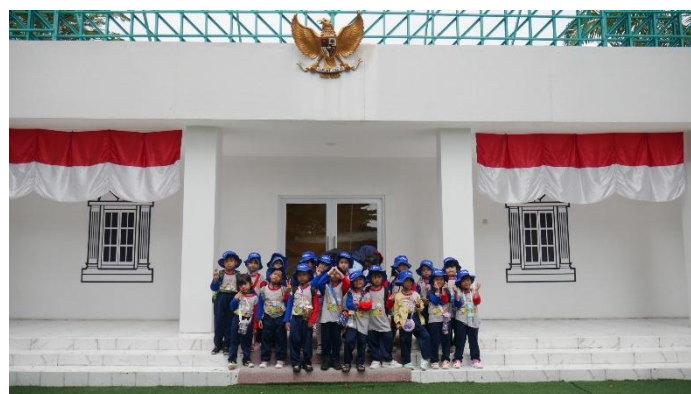
Figure 3. Efforts to synchronize activities with the surrounding environment

Morality is not taught as a doctrine, but is brought to life through warm, consistent, and meaningful relationships. This is in accordance with the following documentation: