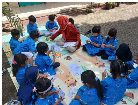
Figure 1. Teacher and Child Instructions

Overall, these findings indicate that teacher-child interactions are multidimensional: they are affective spaces, moral examples, dialogic communication, media for internalizing values, and ongoing habituation processes. Interactions are not merely pedagogical strategies, but relational foundations that enable children's characters to be formed through consistent and meaningful experiences. This is consistent with the following documentation: